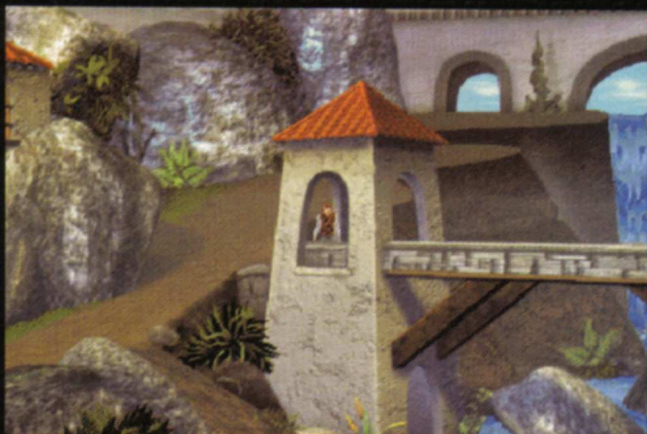
As you cross this bridge, the camera will smoothly pan across and zoom in. With panoramic vistas and shifting views, this will be the most cinematic Quest for Glory yet.

A day and night time cycle has also been put into place, which ever-so-subtly darkens the screen and makes the transition to night every twenty or so minutes. "There's a different feel at night," explains Cole. "Monsters come out at night that don't come out in the daytime, and you have to watch