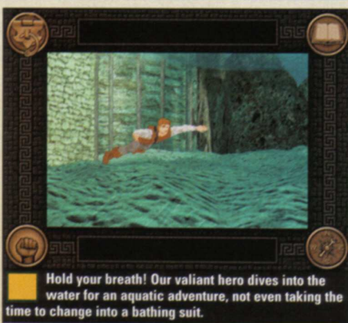
Hold your breath! Our valiant hero dives into the water for an aquatic adventure, not even taking the time to change into a bathing suit.

This new adventure manages to keep the graphical style of its predecessors, while blending several sophisticated new technologies into the mix. Though the backgrounds look like they've been hand-painted, they're the result of Alias rendering software on high-end SGI workstations, followed by graphical touch-up from Sierra's talented team of artists. Your hero has also been liberated from the flat two-dimensional plane, and is given complete freedom of motion as a real-time 3D character à la Alone in the Dark . However, QFG5 's gameplay is an